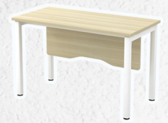
STANDARD TABLE (W/O TEL CAP) SWT126 1200W x 600D x 750H SWT156 1500W x 600D x 750H