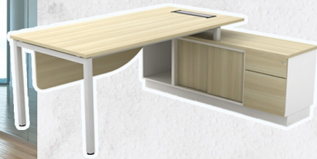
DIRECTOR TABLE SET (INCLUDED YBV20 x 1 NOS) B-SWE2162(E) 2160W x 1600-450D x 750H