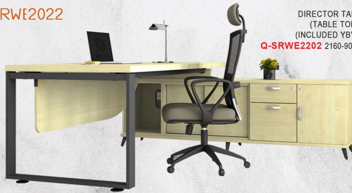
DIRECTOR TABLE SET (R) (TABLE TOP 41THK) (INCLUDED YBV20 x 1 NOS) Q-SRWE2202 2160-900W x 2000-450D x 766H