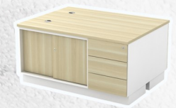
SLIDING DOOR + FIXED PEDESTAL 3D B-YSP1236-2(E) 1200W x 900D x 600H