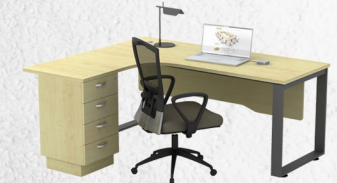
SUPERIOR COMPACT TABLE (L) SQWL1515-4D 1500-700W x 1500-600D x 750H SQWL1815-4D 1800-700W x 1500-600D x 750H