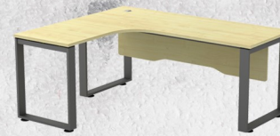
SUPERIOR COMPACT TABLE (L) SQWL1515 1500-700W x 1500-600D x 750H SQWL1815 1800-700W x 1500-600D x 750H