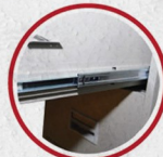
BALL BEARING SLIDE