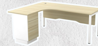
SUPERIOR COMPACT TABLE SWL1515-3D 1500-700W x 1500-600D x 750H SWL1815-3D 1800-700W x 1500-600D x 750H