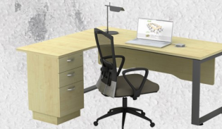
SUPERIOR COMPACT TABLE (L) SQWL1515-3D 1500-700W x 1500-600D x 750H SQWL1815-3D 1800-700W x 1500-600D x 750H