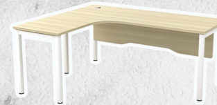
SUPERIOR COMPACT TABLE SWL1515 1500-700W x 1500-600D x 750H SWL1815 1800-700W x 1500-600D x 750H