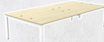
STANDARD TABLE (W/O WOODEN FRONT PANEL) ST127-4 2400W x 1500D x 750H ST157-4 3000W x 1500D x 750H ST187-4 3600W x 1500D x 750H