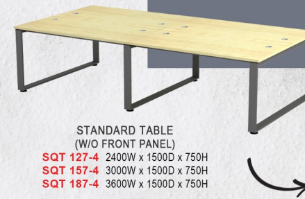
STANDARD TABLE (W/O FRONT PANEL) SQT 127-4 2400W x 1500D x 750H SQT 157-4 3000W x 1500D x 750H SQT 187-4 3600W x 1500D x 750H