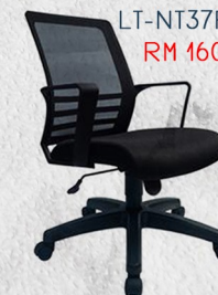
LT-NT37PP RM 160