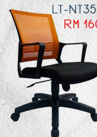
LT-NT35PP RM 160