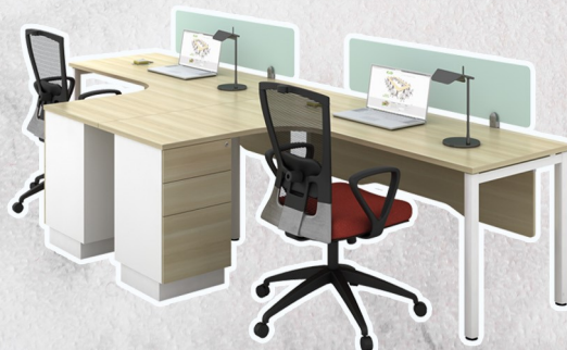
SUPERIOR COMPACT TABLE x 2 NOS SWL1815-3D 1800-600W x 1500-600D x 750H SANDBLAST GLASS x 2 NOS 6STG 300H x 1650W x 6THK BLOCK BRACKET-END x 4 NOS 6/18 BP-E