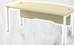
EXECUTIVE TABLE SWB180A 1800W x 900D x 750H