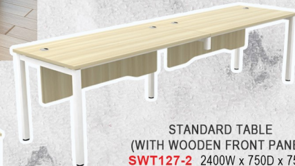
STANDARD TABLE (WITH WOODEN FRONT PANEL) SWT127-2 2400W x 750D x 750H SWT157-2 3000W x 750D x 750H SWT187-2 3600W x 750D x 750H