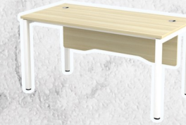
STANDARD TABLE SWT127 1200W x 750D x 750H SWT157 1500W x 750D x 750H SWT187 1800W x 750D x 750H