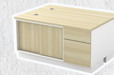
SLIDING DOOR + FIXED PEDESTAL 1D1F B-YSP1226-2(E) 1200W x 900D x 600H