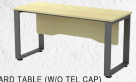
STANDARD TABLE (W/O TEL CAP) SQWT126 1200W x 600D x 750H SQWT156 1500W x 600D x 750H