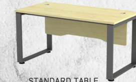
STANDARD TABLE SQWT127 1200W x 750D x 750H SQWT157 1500W x 750D x 750H SQWT187 1800W x 750D x 750H