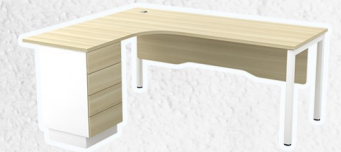
SUPERIOR COMPACT TABLE SWL1515-4D 1500-700W x 1500-600D x 750H SWL1815-4D 1800-700W x 1500-600D x 750H