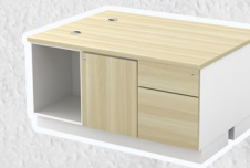
OPEN SHELF + SWINGING DOOR + FIXED PEDESTAL 1D1F B-YDP1226-2(E) 1200W x 900D x 600H