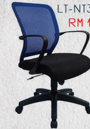
LT-NT34PP RM 160