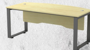
EXECUTIVE TABLE SQWB180A 1800W x 900D x 750H