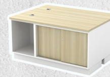
OPEN SHELF + SLIDING DOOR B-YOS1206-2 1200W x 900D x 600H