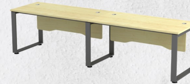
STANDARD TABLE (WITH WOODEN FRONT PANEL) SQWT 127-2 2400W x 750D x 750H SQWT 157-2 3000W x 750D x 750H SQWT 187-2 3600W x 750D x 750H