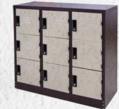
Half Height 9 Compartments