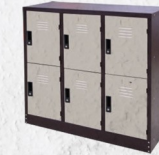
Half Height 6 Compartments